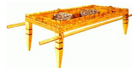
Table of Shewbread

Exodus 25:23 You shall also make a Table of shittim wood: two cubits shall be the length thereof, and a cubit the breadth thereof, and a cubit and a half the height thereof.